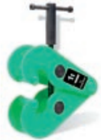
Model 1 ton