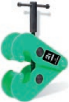
Model 2 tons