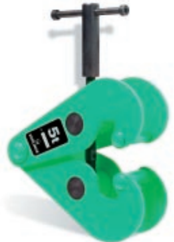
Model 5 tons