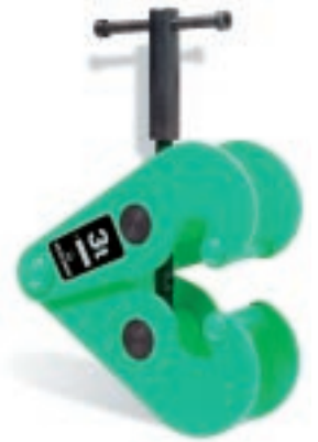
Model 3 tons